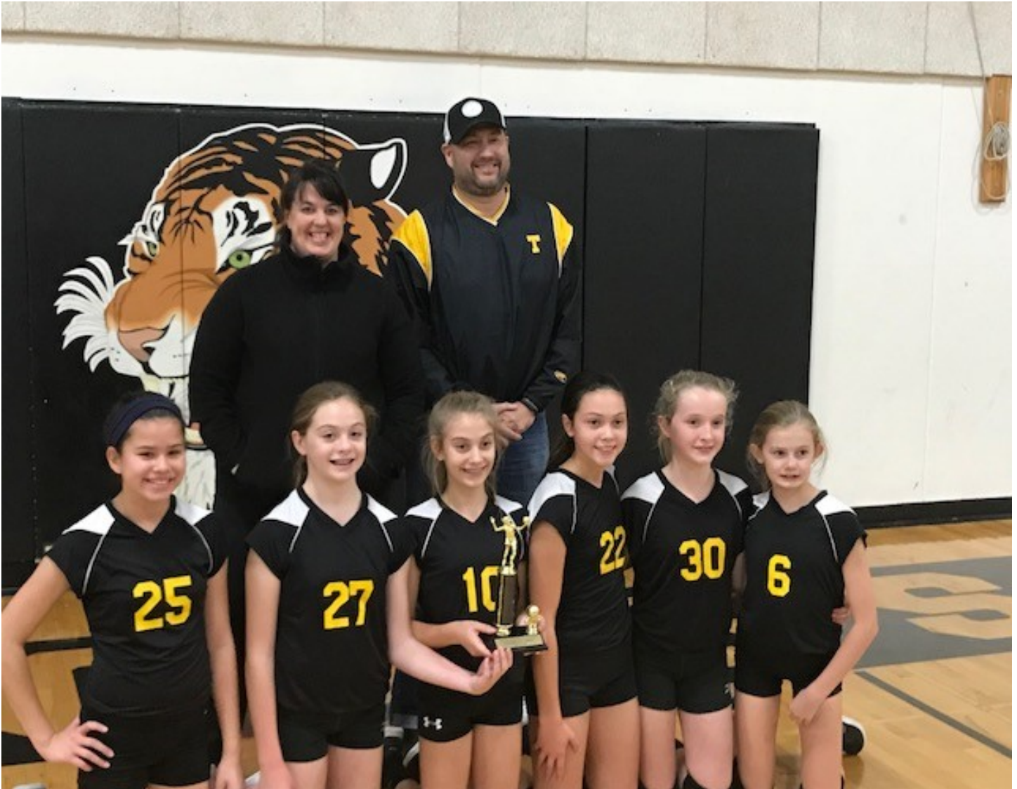
Picture of the 7th grade Volleyball team, along with their trophy. Congrats to them.

PARENTAL/GUARDIAN CONSENT FORM AND LIABILITY WAIVER